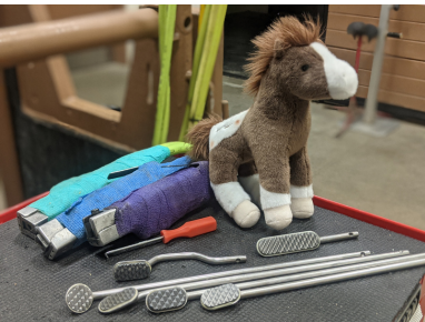
Meet Spots! Our Mascot for "Horse in the Hospital"

Keep an eye out on for our "Horse in the Hospital" piece starting soon! It'll guarantee quality information of behind the scenes in the hospital, and a few good laughs!